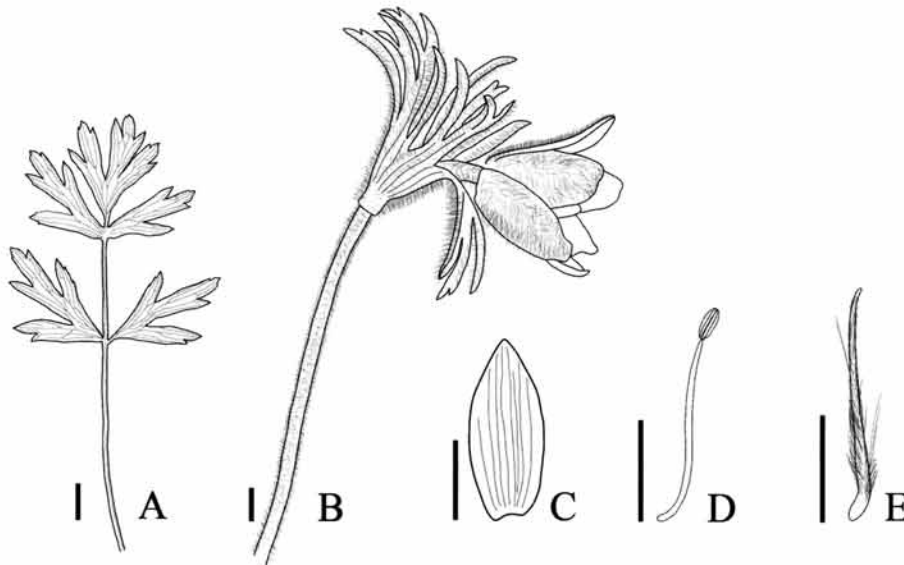
Fig. 2. Pulsatilla x yanbianensis H.Z. Lv A. compound leaf; B. flower; C. sepal; D. stamen; E. pistil. Scale bars = 1 cm.

shape, anther color, pistil shape, etc. The new hybrid, however, has reddish violet sepals and thus can be distinguished from P. cernua with dark red sepals and P. dahurica with pale violet sepals.