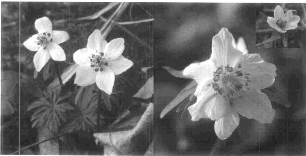
Fig. 2. Photograph of Flowers on Eranthis pungdoensis at type locality.